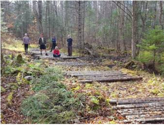
October: draining wet area on B loop, and applying corduroy