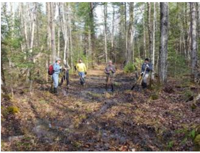
November: draining stagnant area on B loop (before and after)