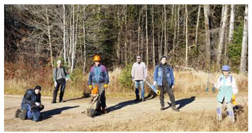
October: trail clearing HSA loop at the Forestry