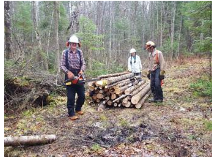
November: cutting surplus balsams for corduroy