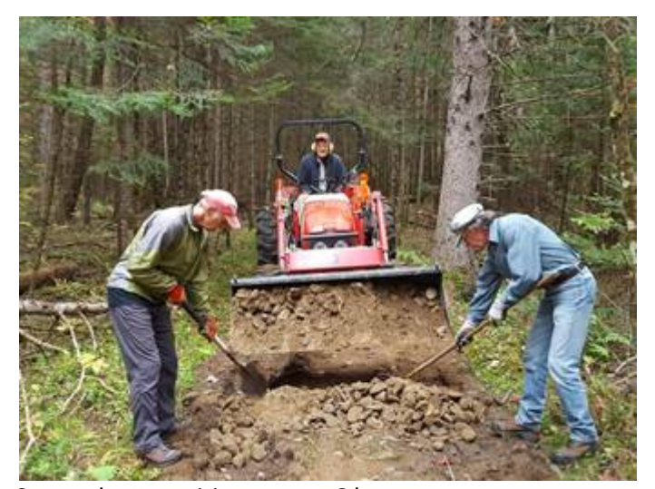
September: repairing ruts on C loop