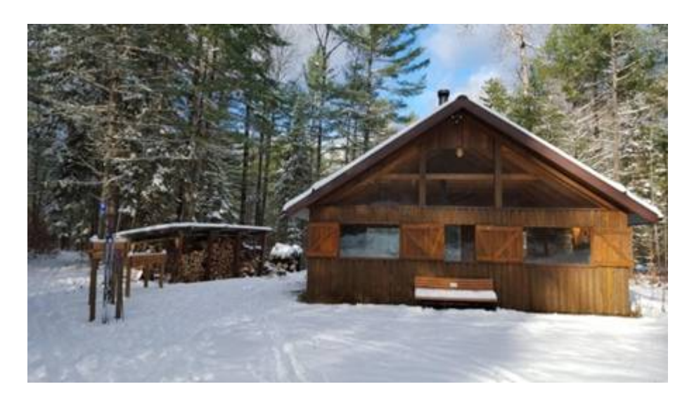
Subject: DRXC Membership Open for 2020/21