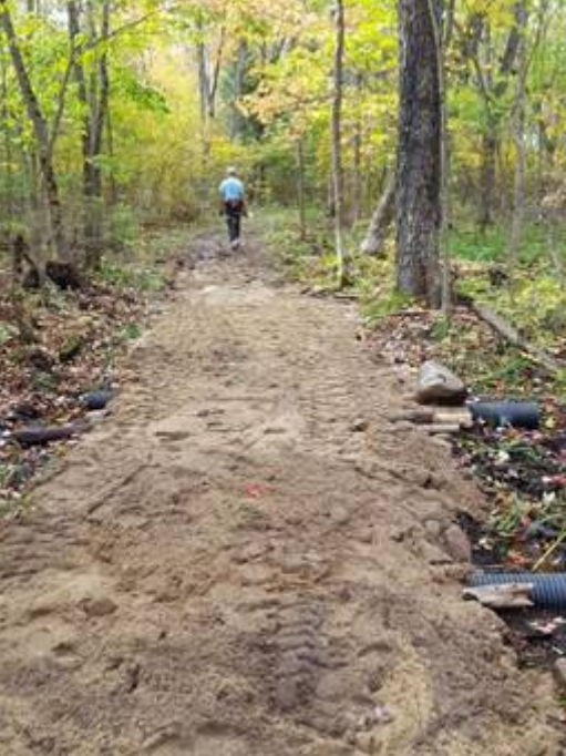
September: adding corduroy, culverts, and sand to C loop wet spot (before and after)