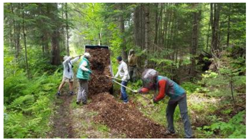
June: spreading wood chips on M loop