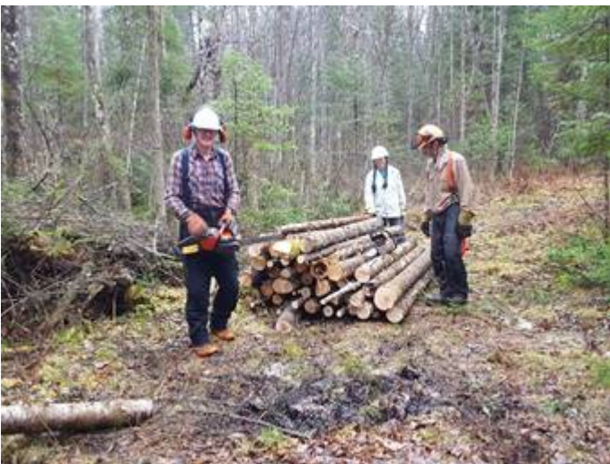
November: cutting surplus balsams for corduroy