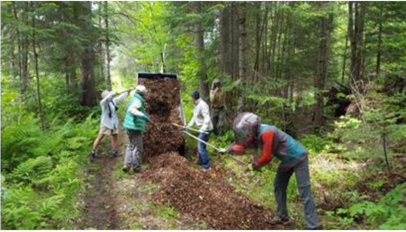
June: spreading wood chips on M loop