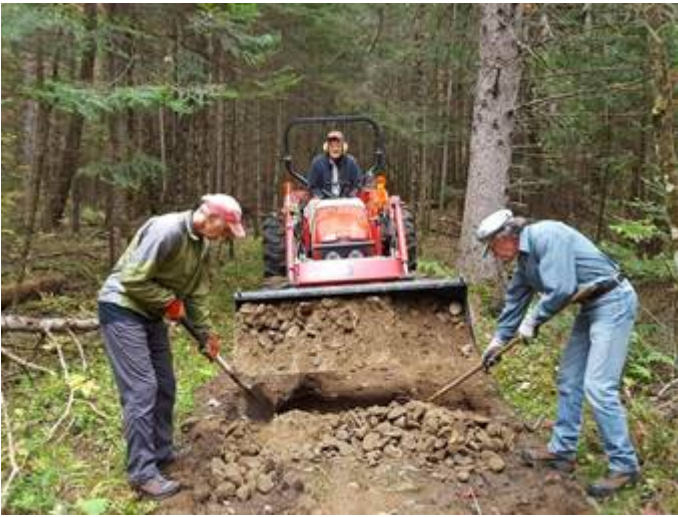
September: repairing ruts on C loop