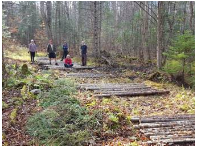
October: draining wet area on B loop, and applying corduroy