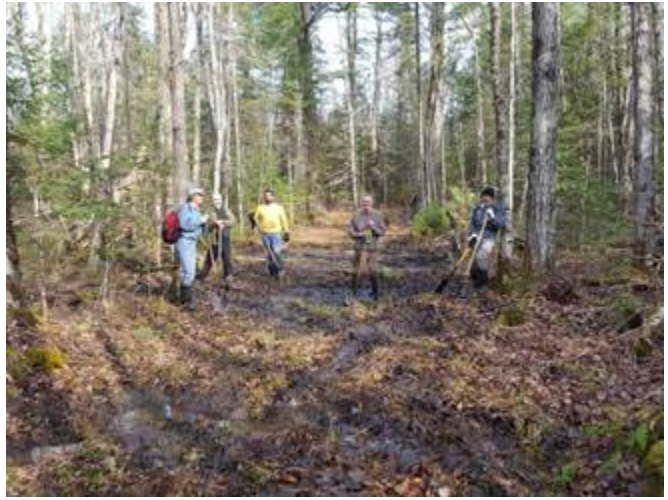
November: draining stagnant area on B loop (before and after)