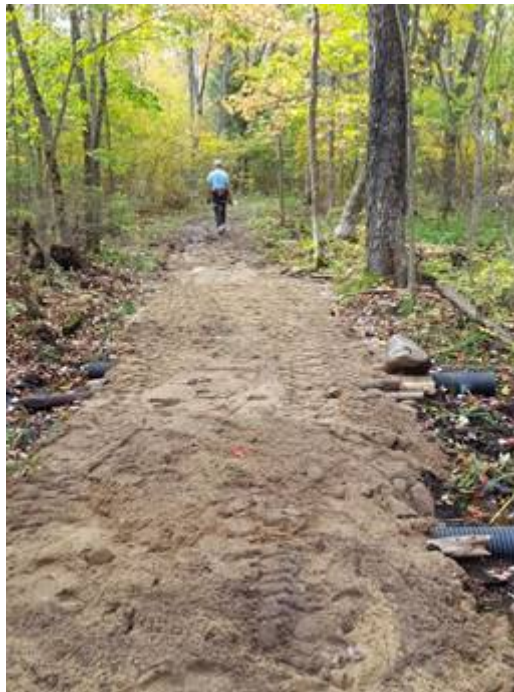
September: adding corduroy, culverts, and sand to C loop wet spot (before and after)