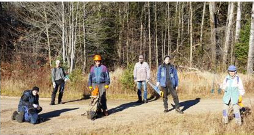
October: trail clearing HSA loop at the Forestry