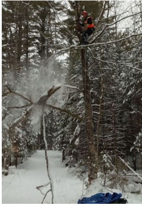
Trail maintenance: cutting through a deadfall on P loop (left), and removing a broken limb hanging over M loop last winter (right).