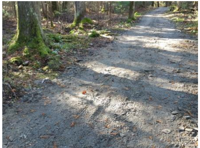
Trail improvements: corduroy (cut from excess balsam) placed over a muddy area on M loop (left), and gravel placed over a bumpy and rocky area on R loop (right).